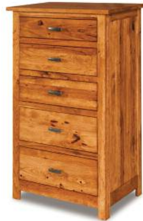
E035 5-drawer chest 33"w x 21"d x 54"h

See price list for other pieces and sizes in this style