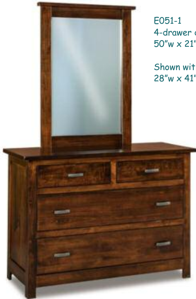
E051-1 4-drawer dresser 50"w x 21"d x 36"h