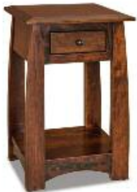
S019-4 1-drawer open nightstand 18"w x 17.5"d x 20"h