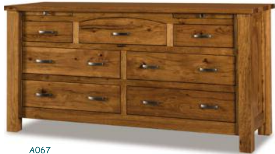
A067 7-drawer, 2-jewelry drawer dresser 69"w x 22"d x 35"h

See price list for other sizes in this style