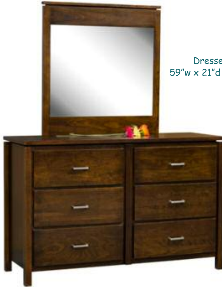
Dresser 59"w x 21"d x 38"h