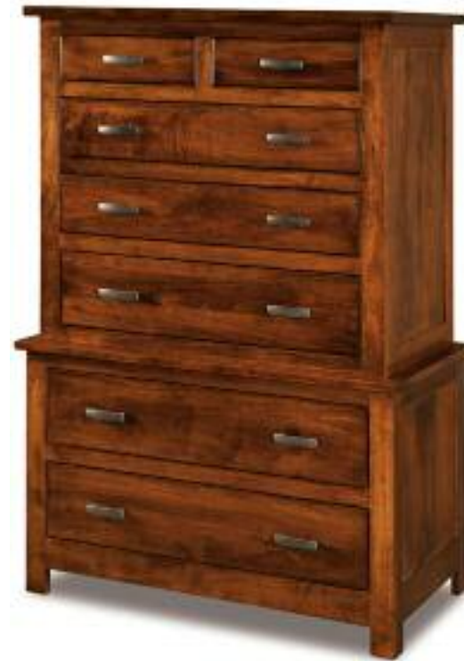
E037 7-drawer chest-on-chest 38"w x 21"d x 57"h

See price list for other pieces and sizes in this style