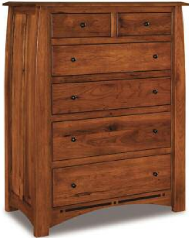
S040 6-drawer chest 41"w x 22"d x 54.75"h