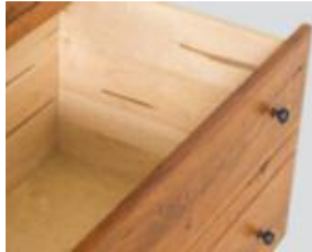
Deep blanket drawer on chest of drawers