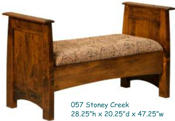
057 Stoney Creek 28.25"h x 20.25"d x 47.25"w