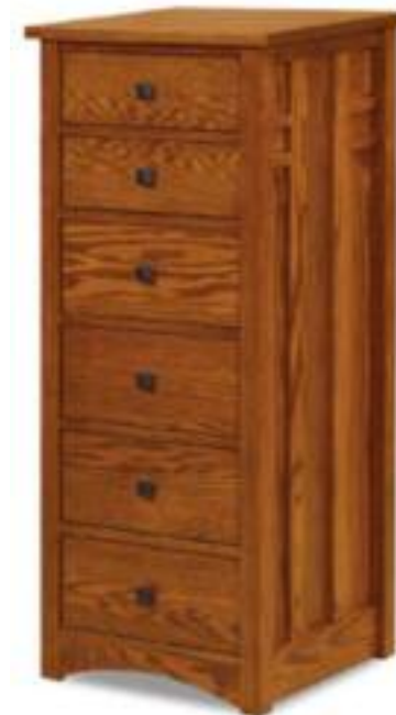
W024 6-drawer lingerie chest 22.5"w x 21"d x 51.5"h