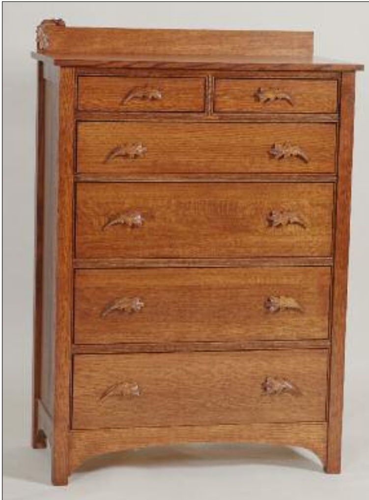
Chest of drawers

Both pieces shown in quarter-sawn white oak with Michaels Cherry stain