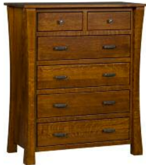
6-drawer chest 42"w x 20.75"d x 49"h