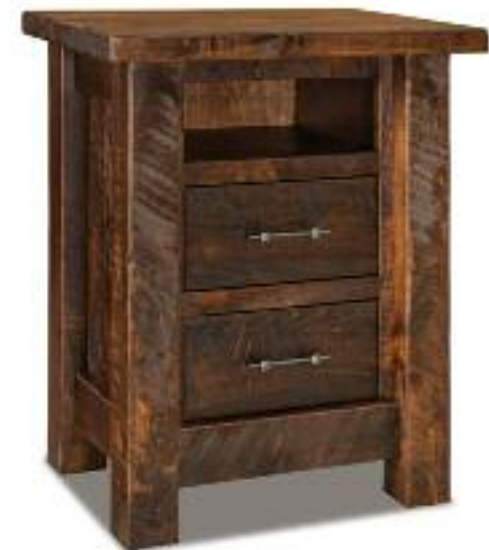
H029-2 2 drawer nightstand 27"w x 19.25"d x 34.75"h

For a complete list of pieces and sizes available in this style, see price list