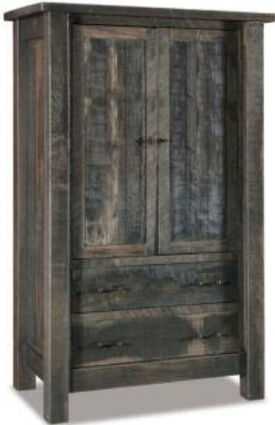
H041 2-drawer, 2-door armoire with 2 interior shelves 45"w x 25.5"d x 74.5"h