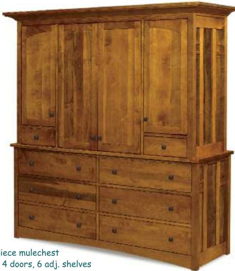
W054 Deluxe 2-piece mulechest 8 drawers, 4 doors, 6 adj. shelves 76"w x 26"d x 78"h Double door opening: 32"w x 20.5"d x 40.5"h