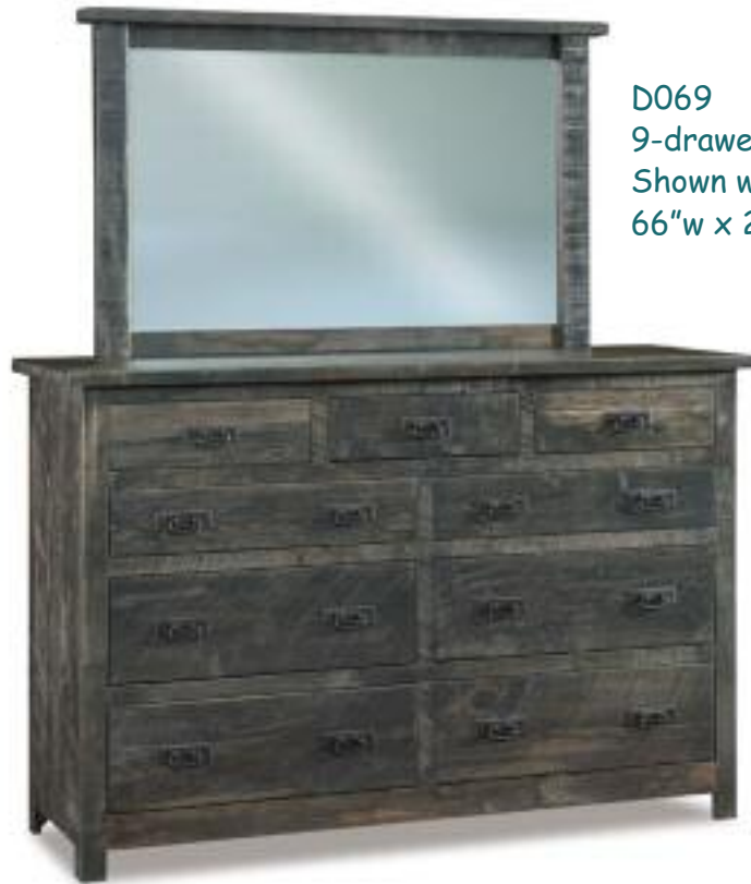
D069 9-drawer dresser Shown with optional mirror 66"w x 21"d x 44"h