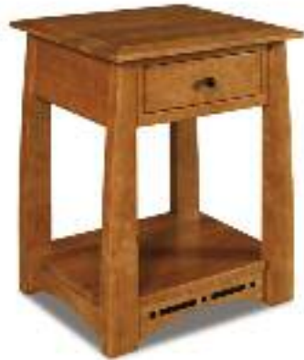
S019 1-drawer open nightstand 22"w x 19.5"d x 30"h