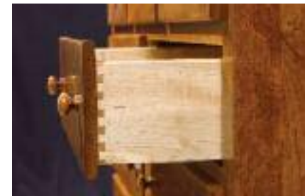
Blum under-mount hidden drawer guide, soft closing