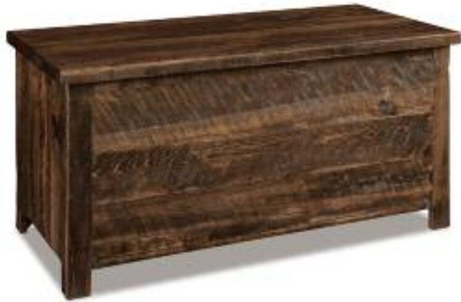
D044 Blanket chest with cedar bottom 44"w x 21"d x 22"h