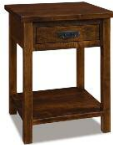
D019 1-drawer, open-style nightstand 22"w x 19"d x 29"h