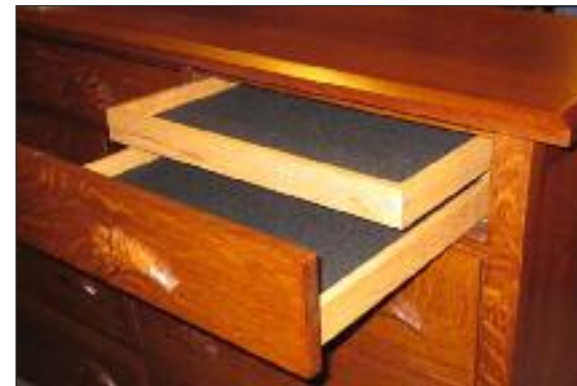
A Terry Hanover design

Optional jewelry drawer can be added to any Acorn dresser or chest