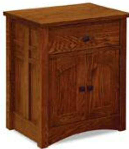
W028 1-drawer, 2-door nightstand 25"w x 17"d x 28"h