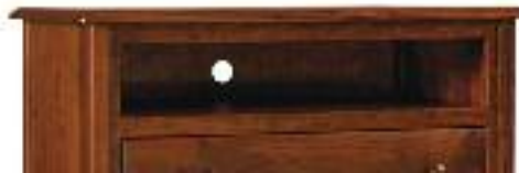
W040-2 4-drawer media chest media cubbie replaces top drawers of W040 39"w x 21"d x 49"h