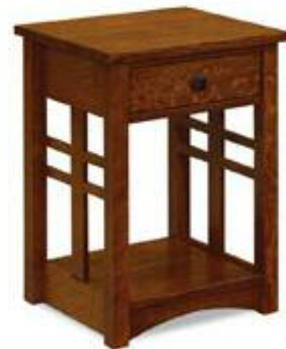
W019 1-drawer open nightstand 21"w x 18"d x 28"h