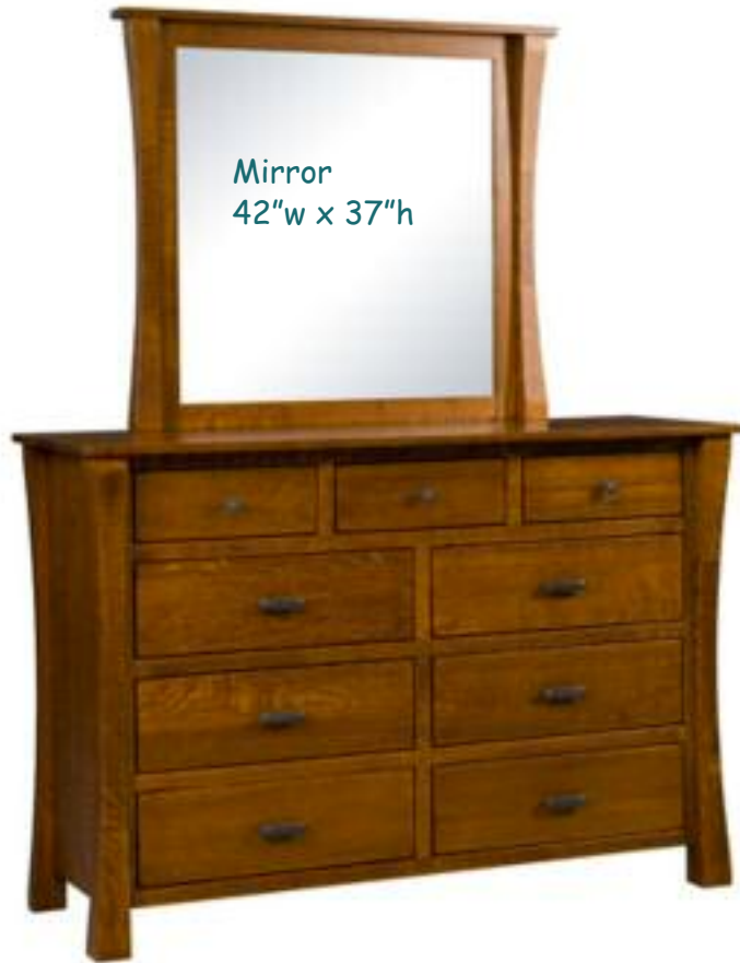
Mirror 42"w x 37"h