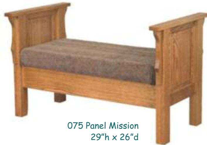
075 Panel Mission 29"h x 26"d