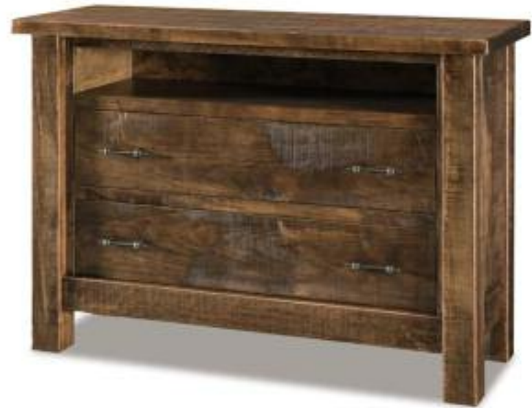
H051-2 2-drawer media chest 55"w x 19.25"d x 40.25"h

For a complete list of pieces and sizes available in this style, see price list