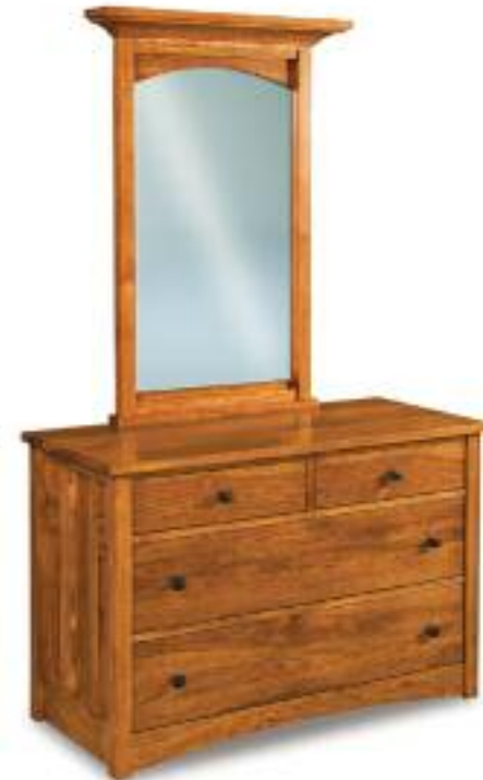
W051-1 4-drawer dresser 49"w x 21"d x 32.5"h