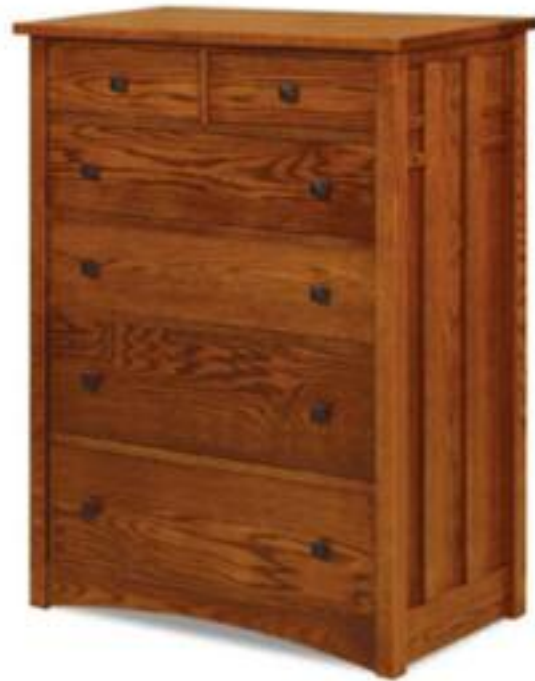
W040 6-drawer chest 39"w x 21"d x 49"h