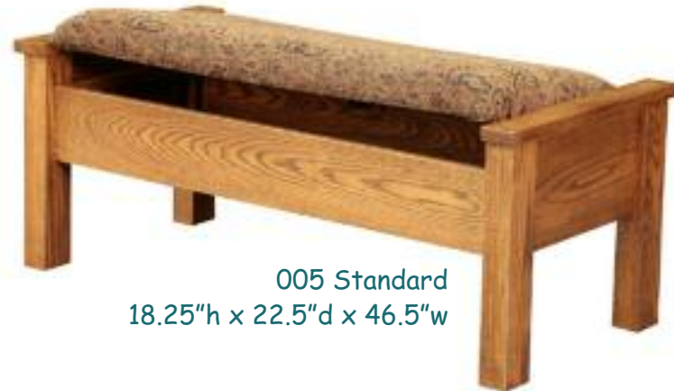
005 Standard 18.25"h x 22.5"d x 46.5"w