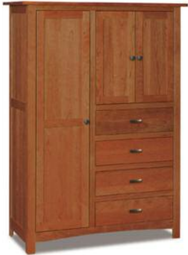
E052 4-drawer, 3-door chifferobe with 5 interior shelves 50"w x 21"d x 71"h