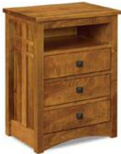
W029 3-drawer nightstand w/cubbie 25"w x 17"d x 33"h