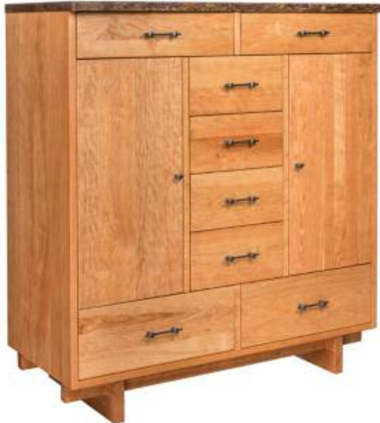
His & hers chest, 52.25"w x 22.5"d x 57.25"h