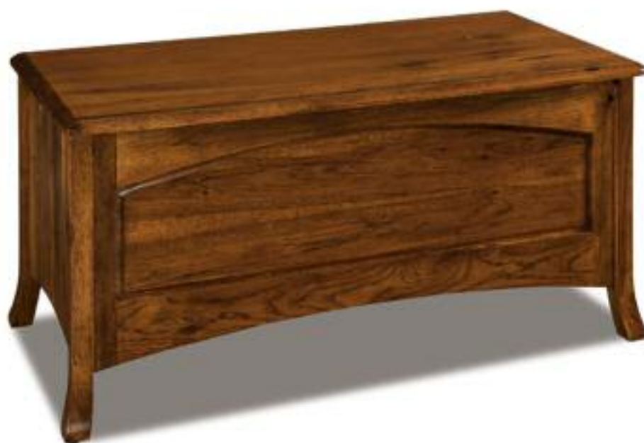
M044 BlanketChest with cedar bottom 44"w x 21.5"d x 22.5"h