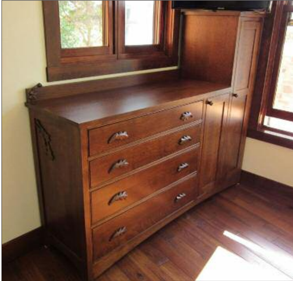
Side-by-Side features handcarved oak branch carving on one side and oak leaf pulls

Optional jewelry drawer can be added to any Acorn dresser or chest