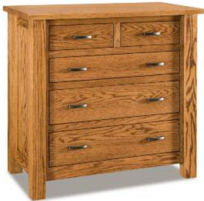
A032-1 5-drawer child's chest 43"w x 22"d x 42"h