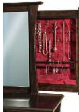
Jewelry slide-out optional with dresser mirrors