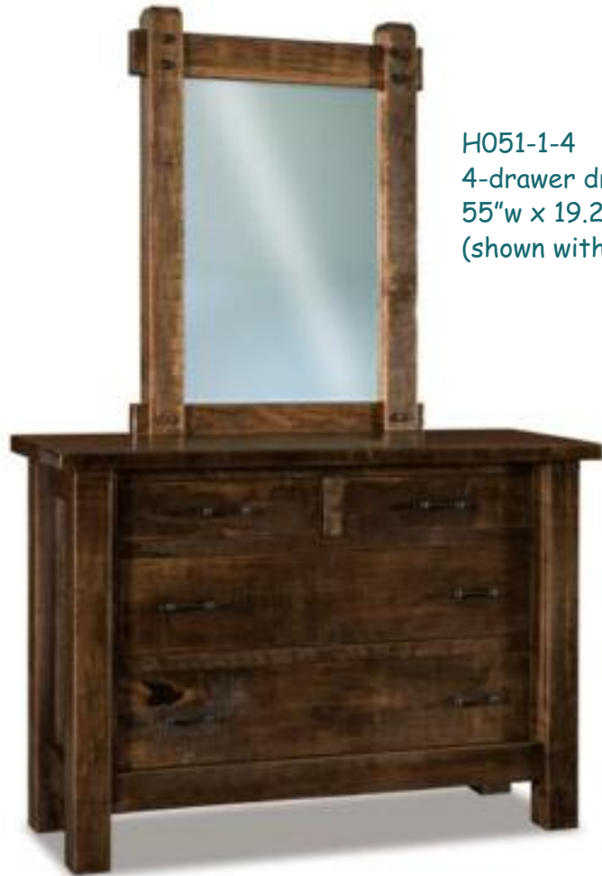
H051-1-4 4-drawer dresser 55"w x 19.25"d x 40.25"h (shown with mirror 047-1)