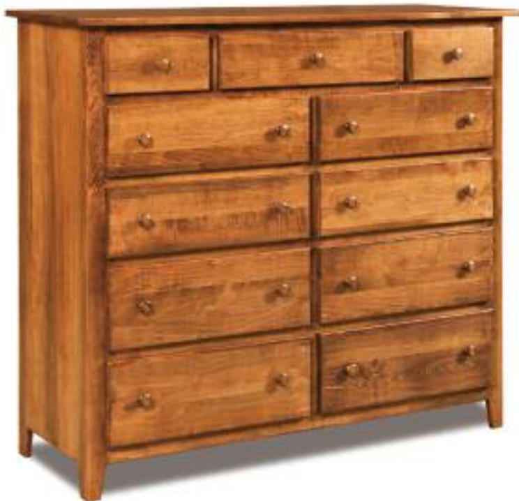
S055 Double chest, 11 drawers