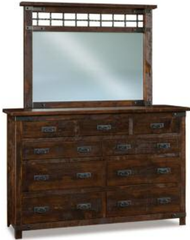
I069 9-drawer dresser 66"w x 21"d x 43.75"h (shown with mirror 045)