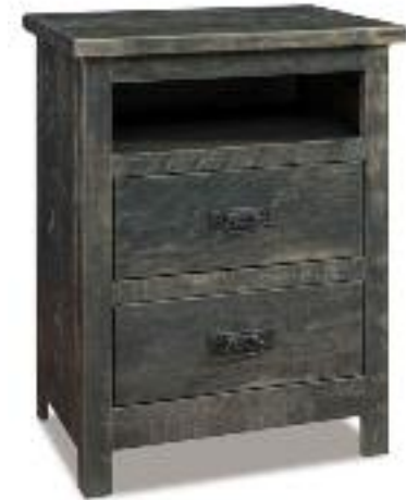
D029-2 2-drawer nightstand 25"w x 17"d x 32.5"h

See price list for other pieces and sizes in this style