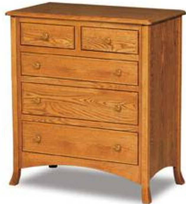
M032-1 5 drawer child chest 40"w x 21.5"d x 44"h

For a complete list of pieces and sizes available in this style, see price list