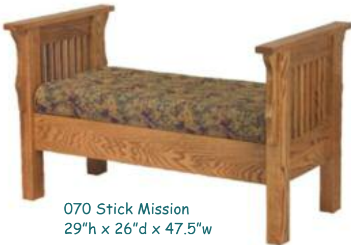
070 Stick Mission 29"h x 26"d x 47.5"w