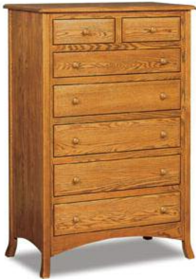
M042 7-drawer chest 40"w x 21.5"d x 60.5"h