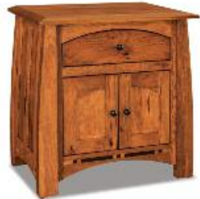
S028-5 1-drawer, 2-door nightstand 27.5"w x 18"d x 30"h

For a complete list of pieces and sizes available in this style, see price list