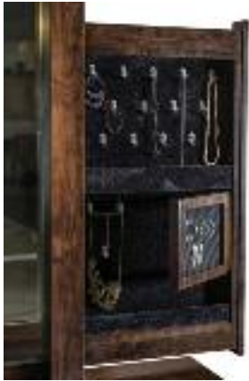
Jewelry slide-out conceals behind dresser mirror