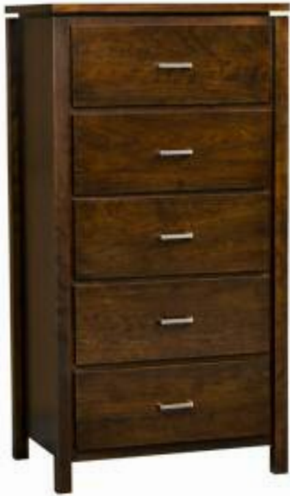
Chest of drawers 31"w x 21"d x 58"h