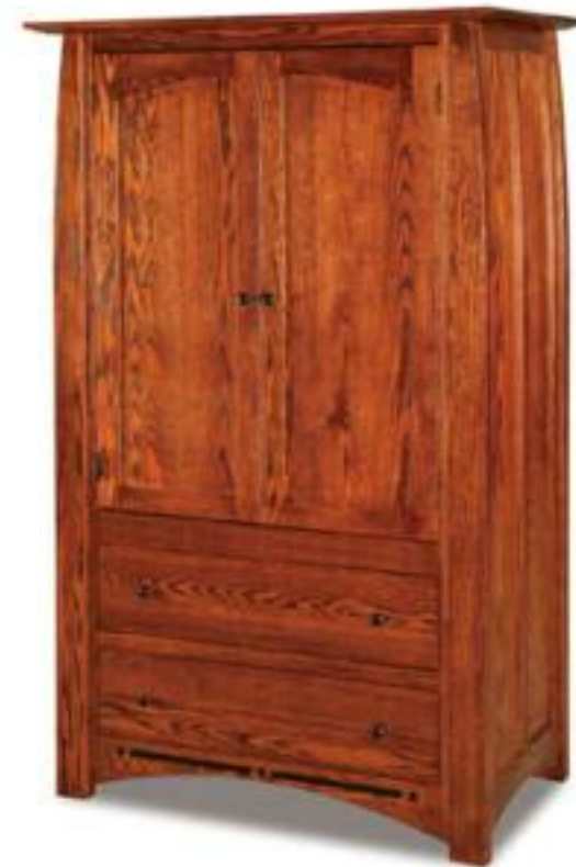
S041 2-drawer, 2-door armoire with 2 shelves 43"w x 25"d x 41.5"h

For a complete list of pieces and sizes available in this style, see price list