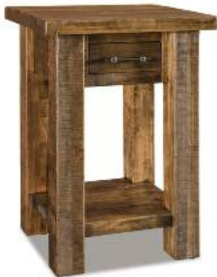
H019-4 1 drawer, open style nightstand 22.25"w x 19.5"d x 31.5"h