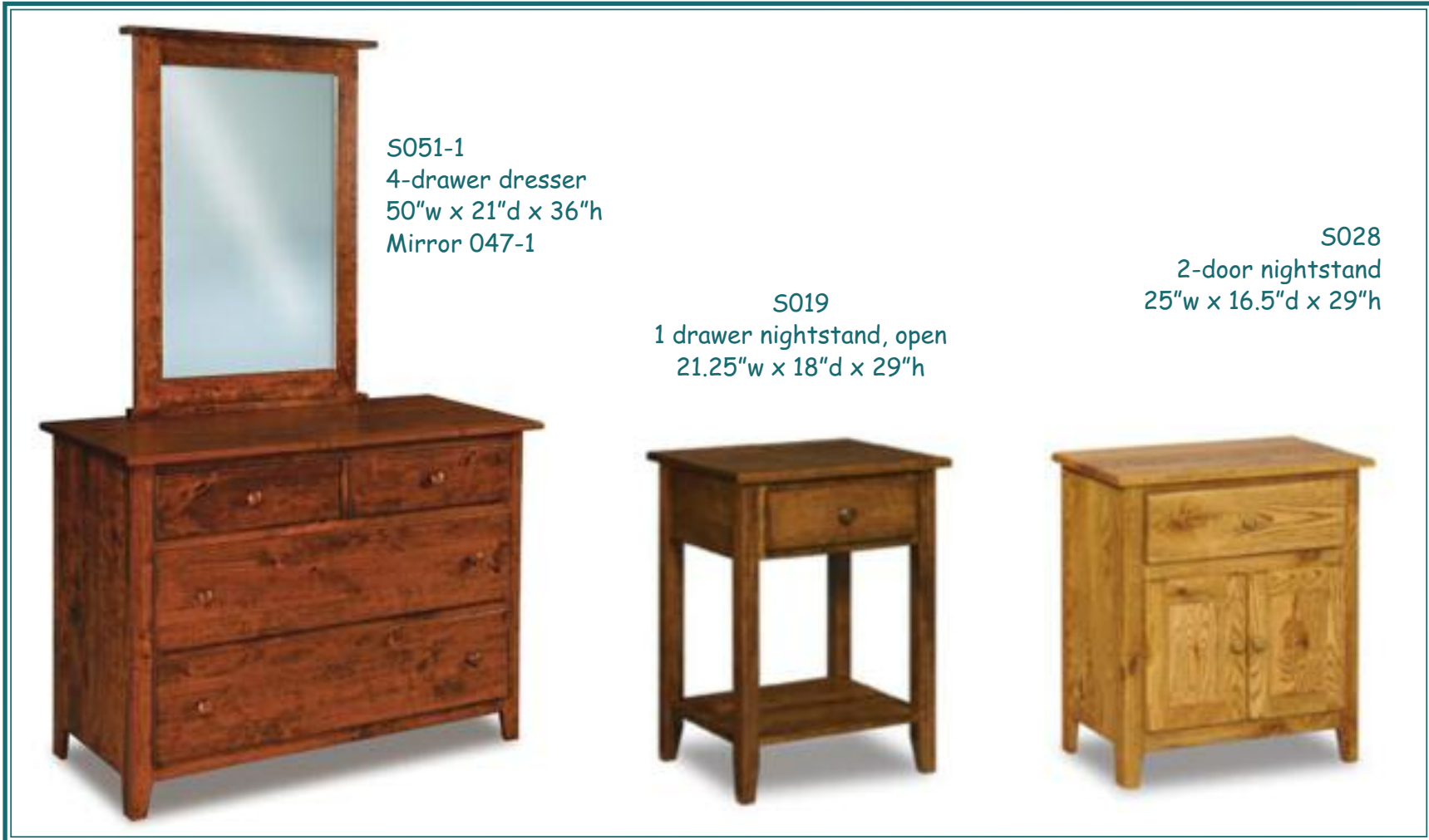
S051-1 4-drawer dresser 50"w x 21"d x 36"h Mirror 047-1