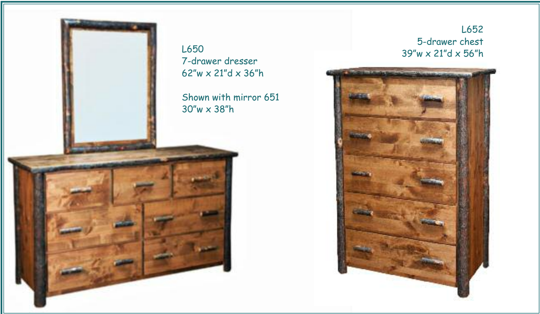
L650 7-drawer dresser 62" w x 21" d x 36" h