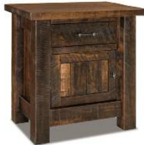
H022-3 1 drawer, 1 door nightstand 30"w x 19.25"d x 31.5"h