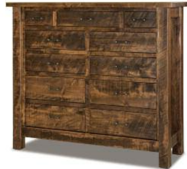
H055 11-drawer double chest 64"w x 23.25" x 58"h

For a complete list of pieces and sizes available in this style, see price list