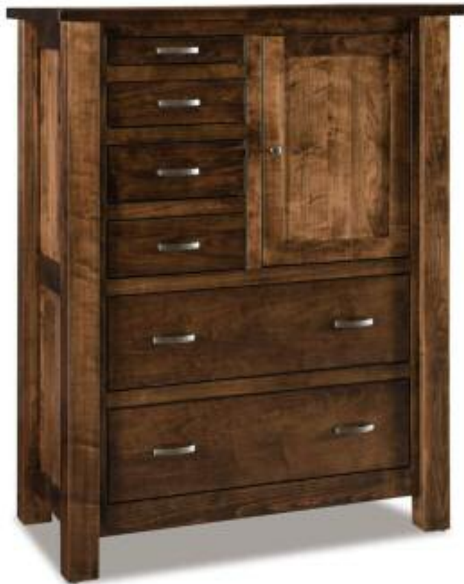
A062 6-drawer, 1-door gentleman's chest 43"w x 22"d x 55"