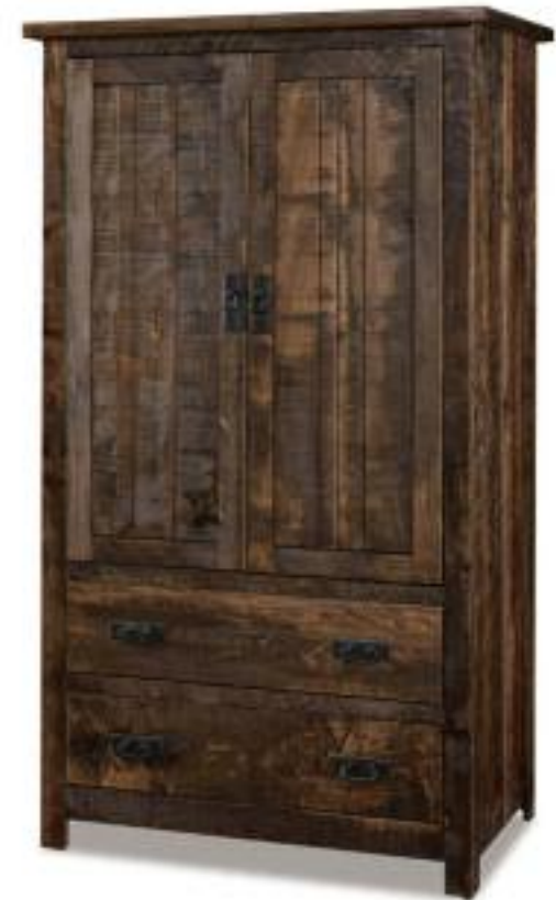
D041 2-drawer, 2-door armoire with 2 interior shelves 40"w x 23"d x 71"h

See price list for other pieces and sizes in this style