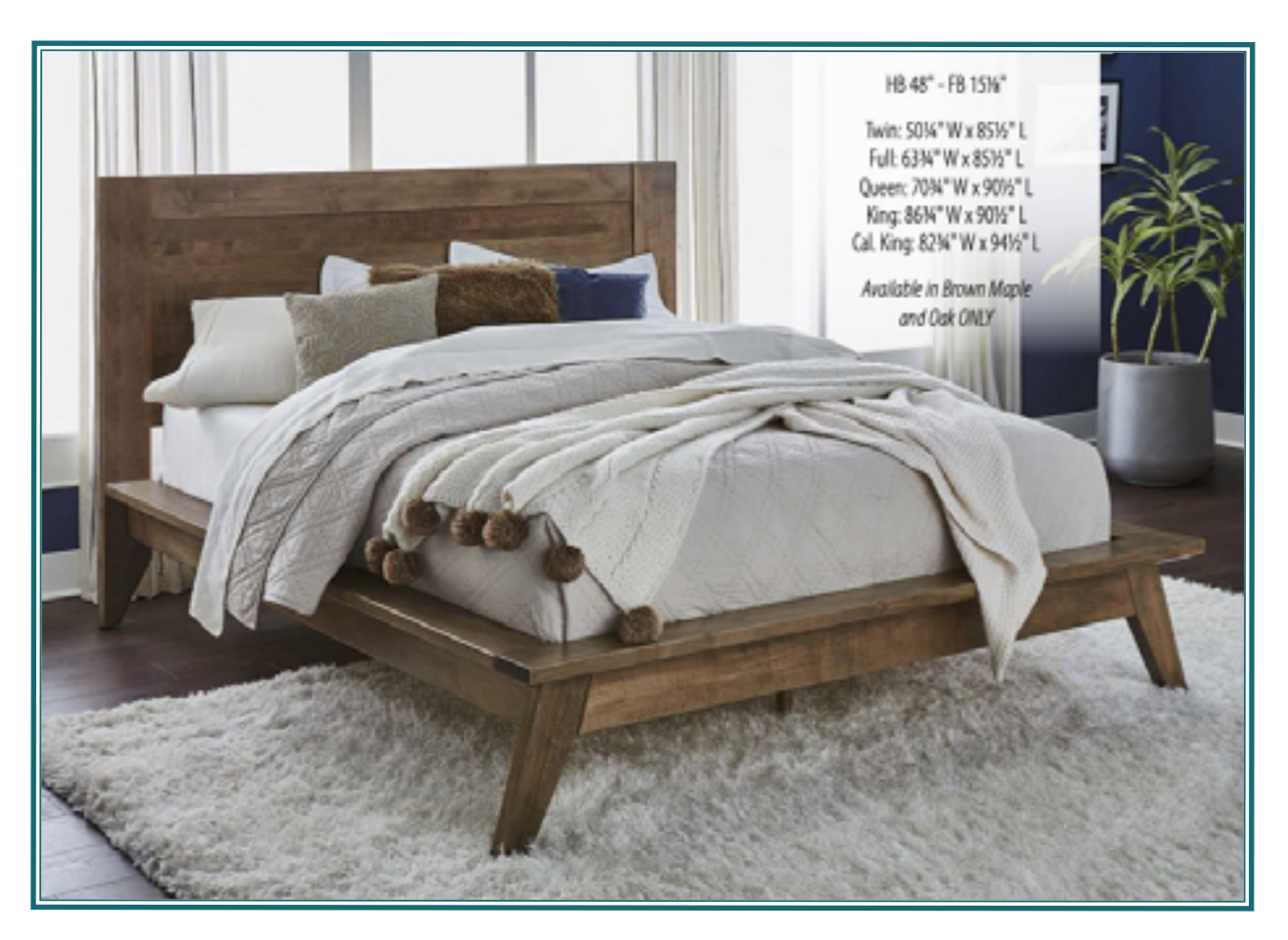
#034 Shown in brown maple with Sandstone stain