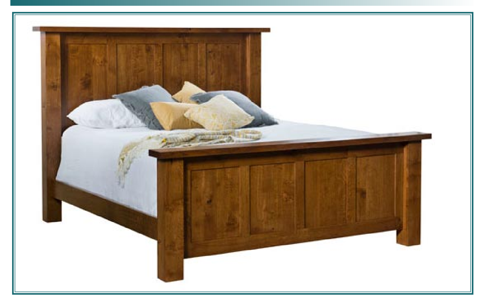
#079 Shown in quarter-sawn white oak with Lite Asbury stain Headboard is 64" high, footboard 33"