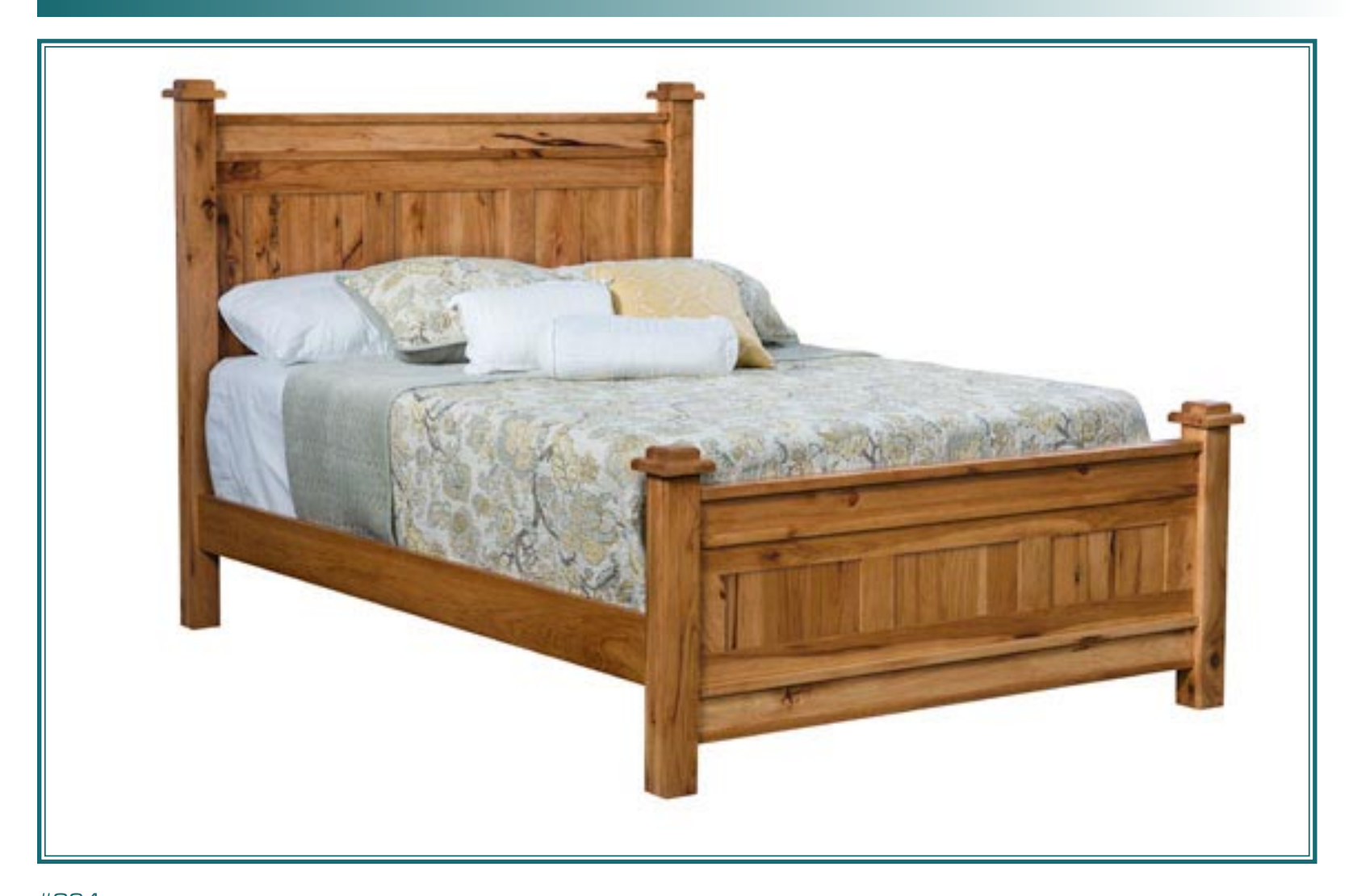
#064 Shown in rustic hickory with Chestnut stain Headboard is 58" high, footboard 29"