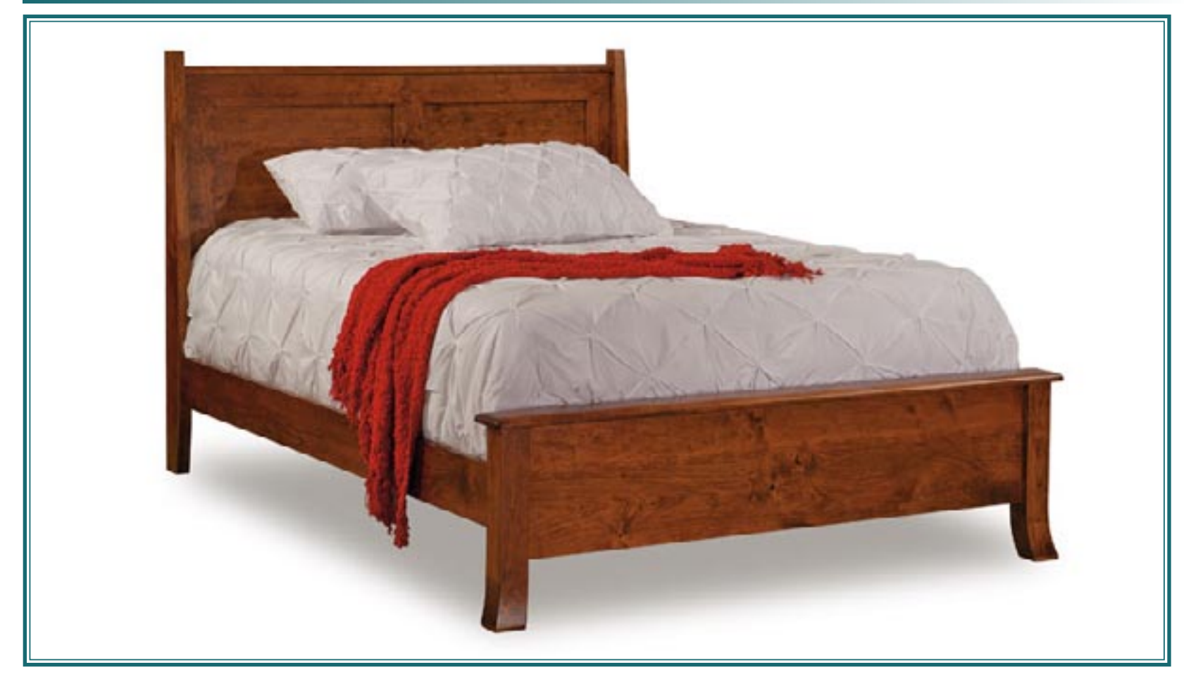
#035 Shown in rustic cherry with Michaels Cherry stain Headboard is 52" high, footboard 20" Option: Caps on headboad (as shown on footboard )