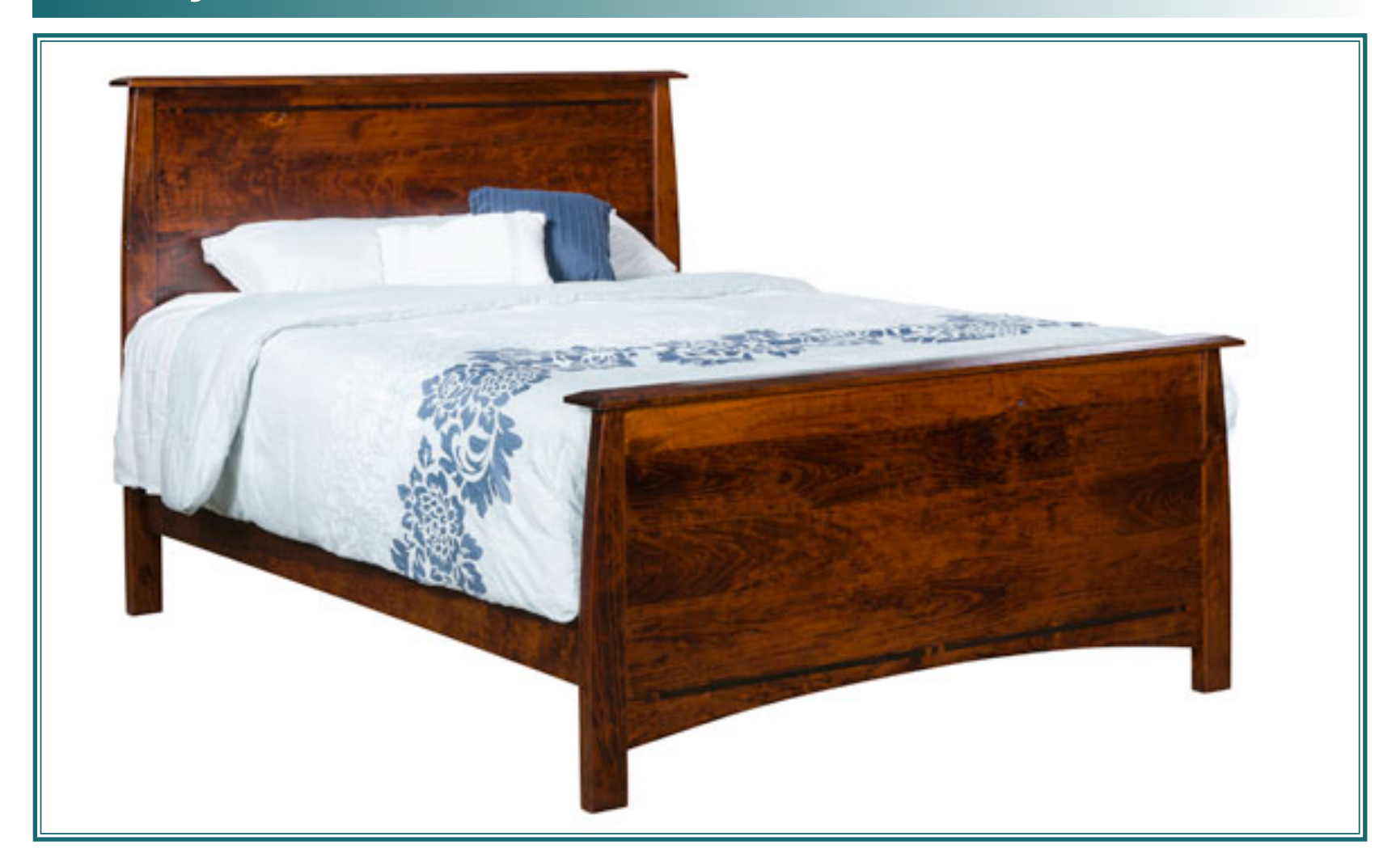
#057-C Shown in rustic cherry with Burnt Umber stain Headboard is 53" high, footboard 31"