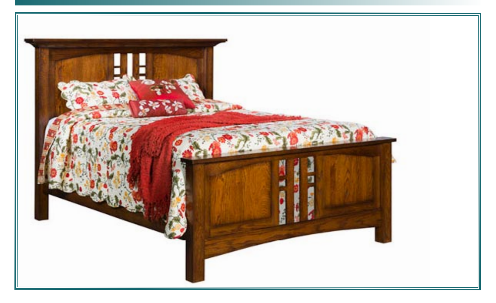
#076 Shown in red oak with Michaels Cherry stain Headboard is 57" high, footboard 29"