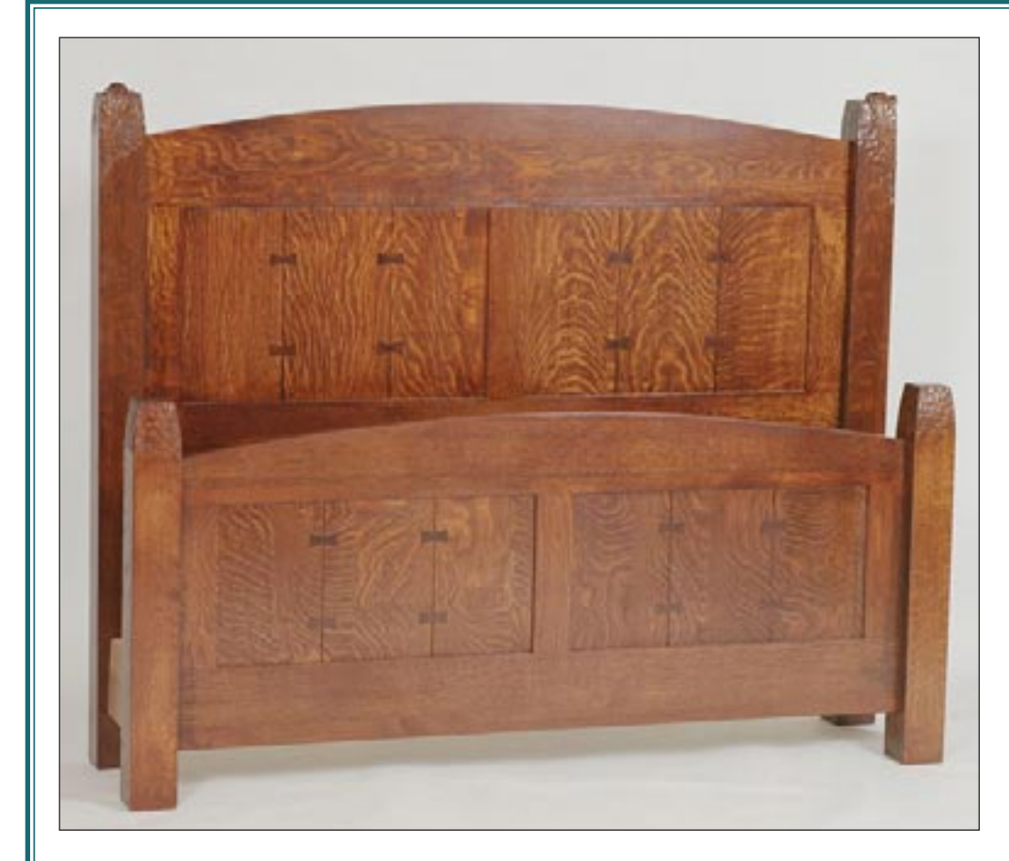
Features walnut butterly joints and handcarved oak leaves and acorns on posts. A Terry Hanover Design