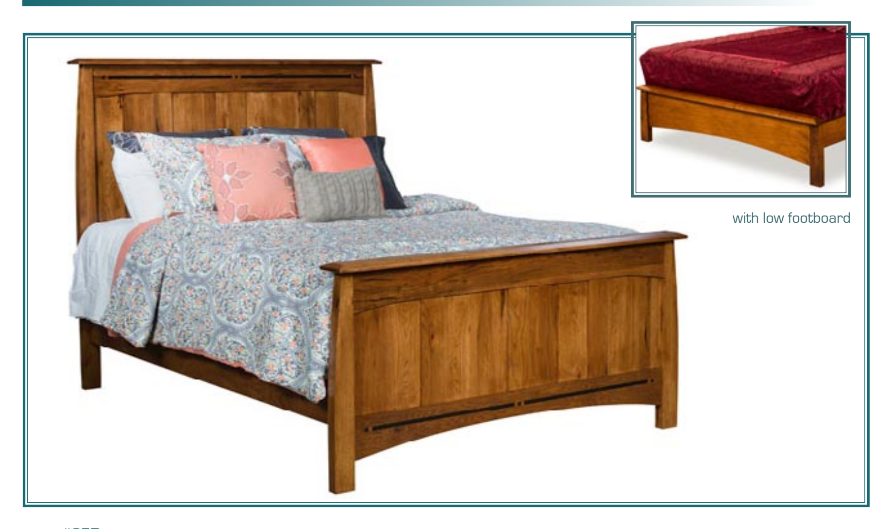
#057 Shown in rustic hickory with Golden Harvest stain Headboard is 59" high, footboard 31"