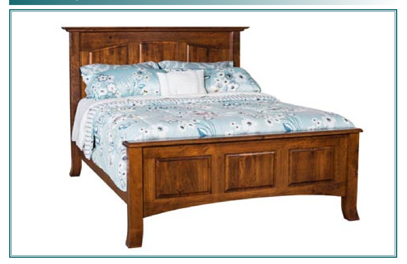
#078 Shown in rustic cherry with New Carrington stain Headboard is 53" high, footboard 26"