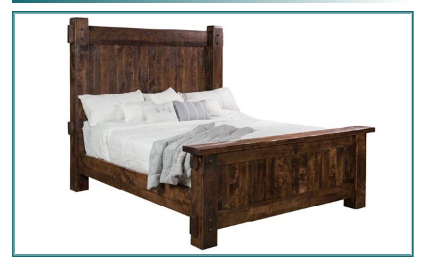
#091-1A With massive 6" square posts Shown in rustic rough-sawn brown maple with Almond stain Headboard is 76" high, footboard 32"