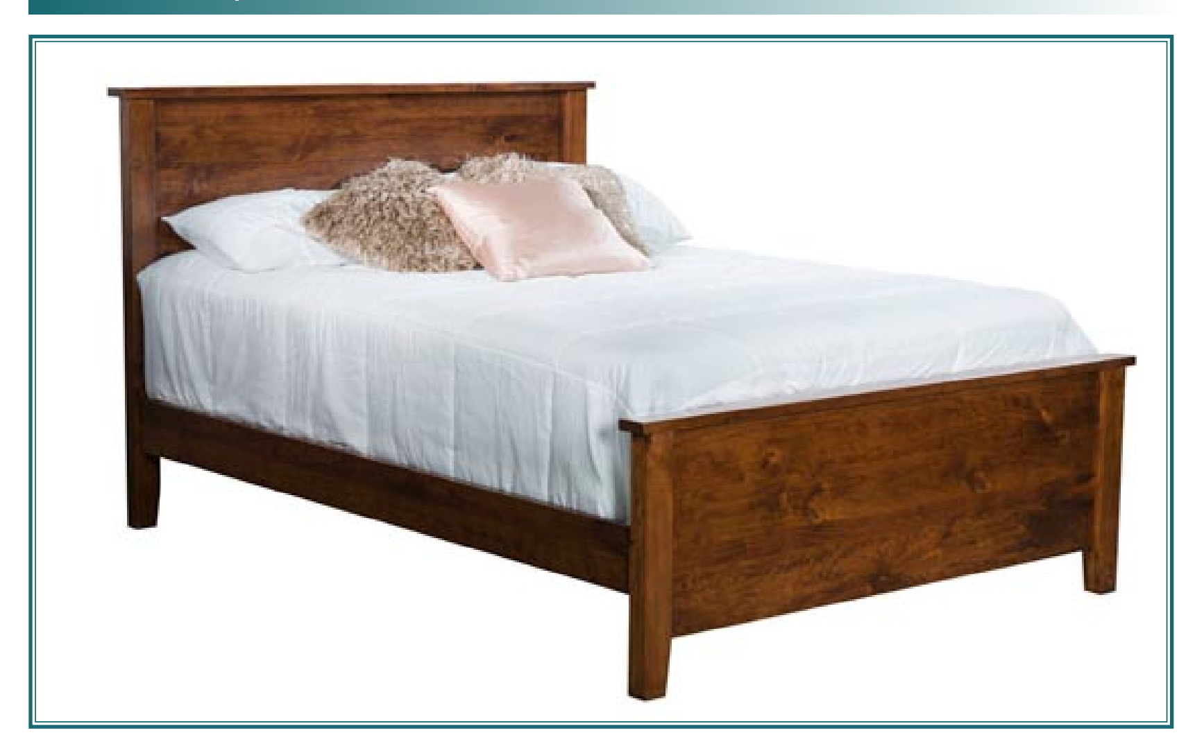
#072 Shown in rustic cherry with Tavern stain Headboard is 48" high, footboard 24"