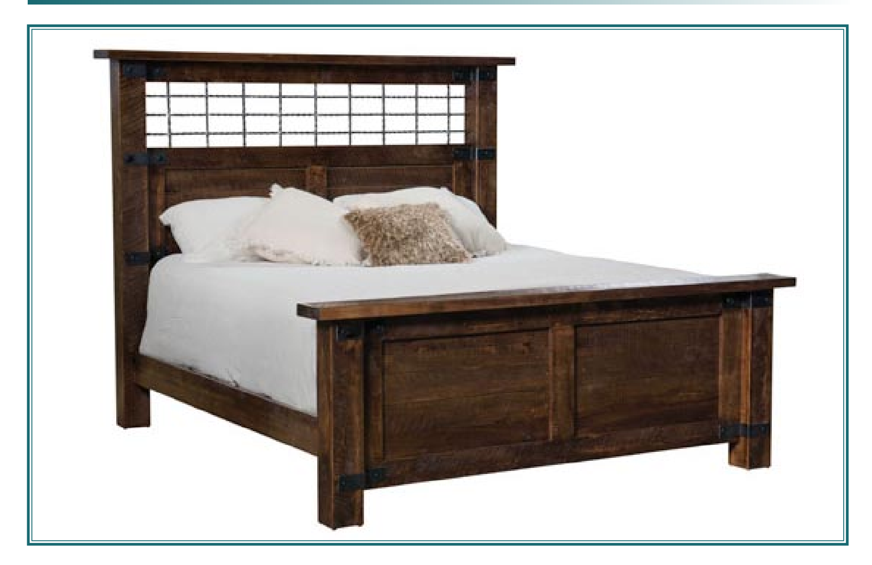
#085 Shown in rustic rough-sawn brown maple with Almond stain Headboard is 70" high, footboard 32"